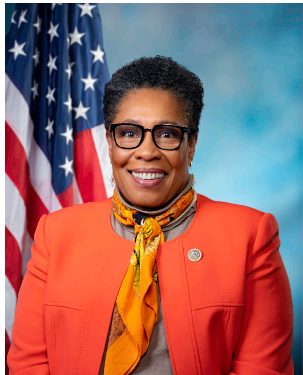
HUD Secretary Marcia Fudge

HUD Secretary Marcia Fudge emphasized the importance of this funding effort, stating, “American families deserve a safe and healthy place to call home. However, in many older homes, lead-based paint can be a serious threat to the health and well-being of children.” With this grant, we can identify and address homes where occupants are at risk of lead exposure and other health hazards, reinforcing our promise of a healthier, stronger community.